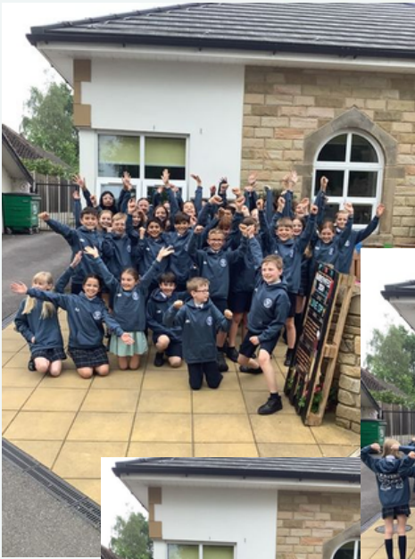
Our amazing Year 6 children wearing their leavers' hoodies